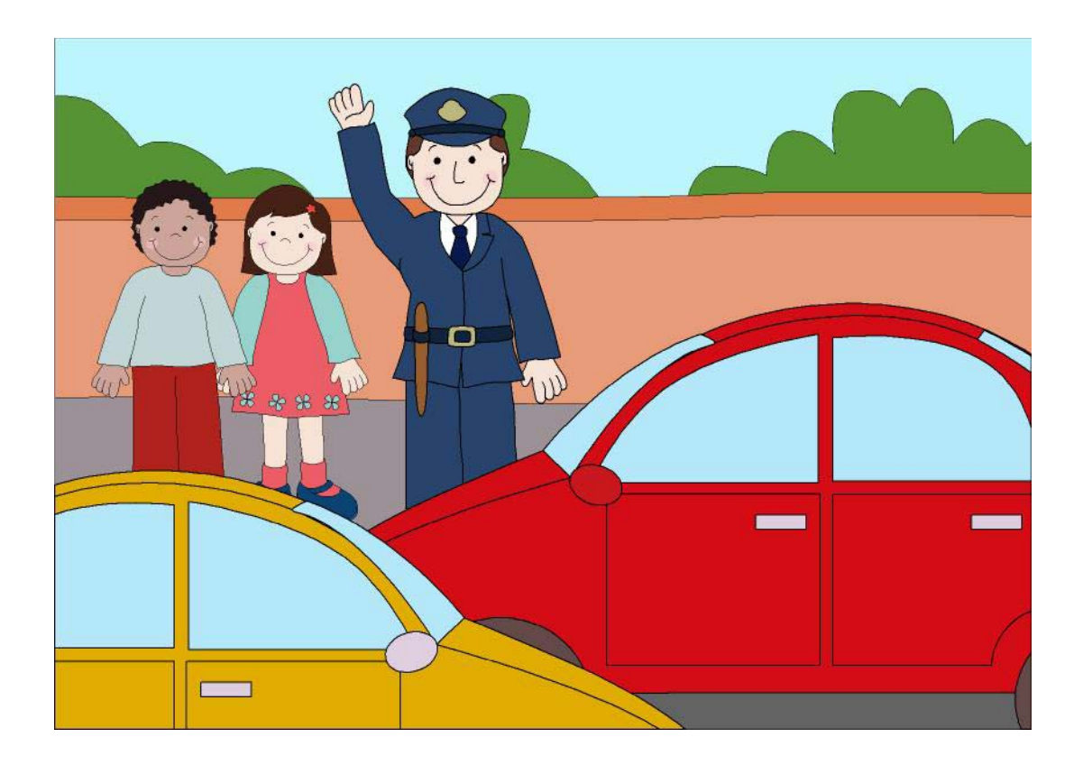
Activity no 2 "My friend the police officer"