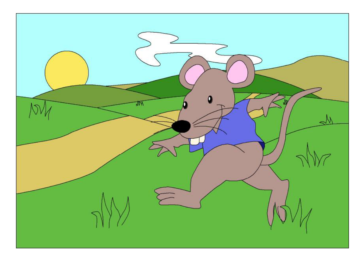
Activity no 1 "Contest: Respect for other people's rights is peace"